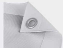
welding and grommets

Any combination of these, or custom finishing is also available upon request.