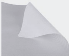
Cut to size