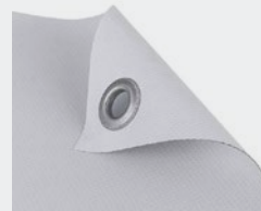
Cut to size and grommets