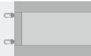
Hemmed all around, with loop and carabiner fastening on any chosen side