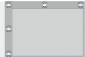
Hemmed all around with reinforcement strap and grommets

Any combination of these, or custom finishing is also available upon request.